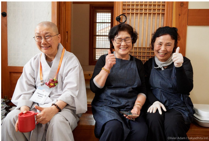
Some of our much-loved conference volunteers on a break at Baekdamsa Temple.